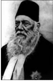
6) JYOTHIRAO PHULE