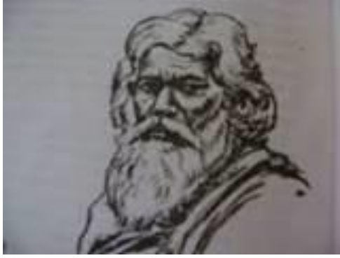
2) RAJA RAM MOHAN ROY