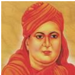
5) SIR SAYYAD AHMAD KHAN