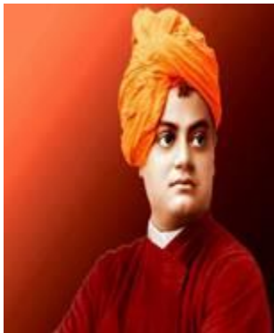
8) BAL GANGADHAR THILAK